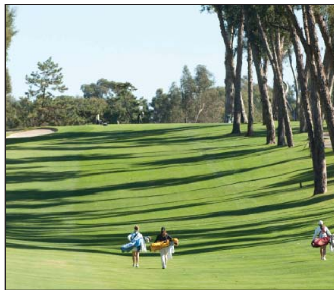
Palos Verdes Golf Club