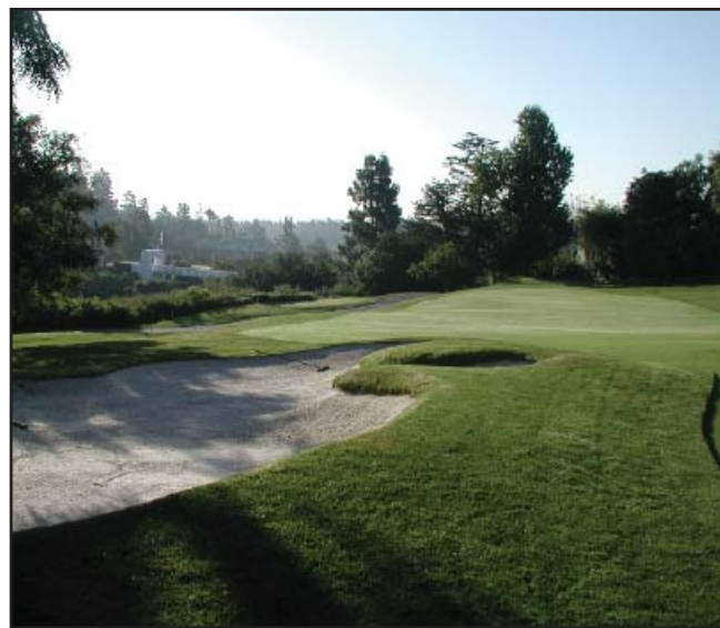
Bel-Air Country Club

Wilshire Country Club: Medium length course that boasts the city's best greens. A barranca runs through the course and comes into play on almost all the holes. Boasts an excellent chipping and putting area and a well-maintained range. Carries a course rating of 75.6 at 6,981 yards and a slope of 145. The Bruins play here on Wednesdays.