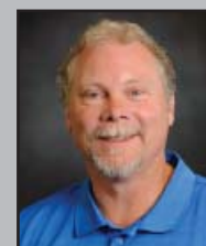
Paul Brown Event Management