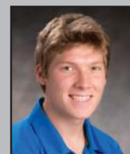
Albro Lundy Sports Information