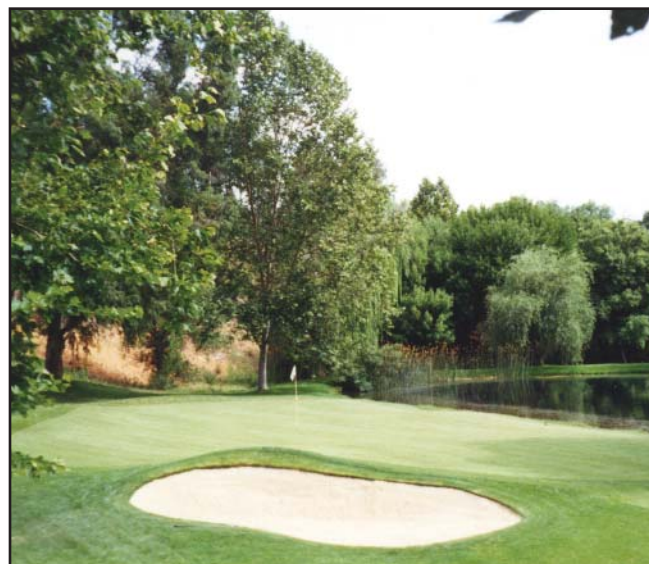
Valencia Country Club