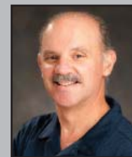
Rich Bertolucci Sports Information